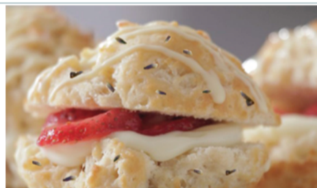
Lemon Lavender Biscuit with Sweet Mascarpone Drizzle