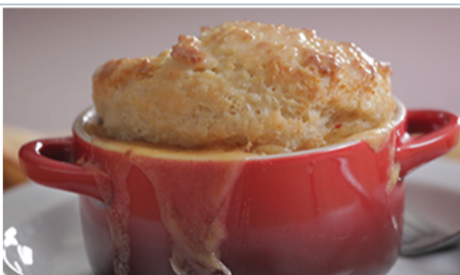
Molten Crab Biscuits with Pimento Cheese