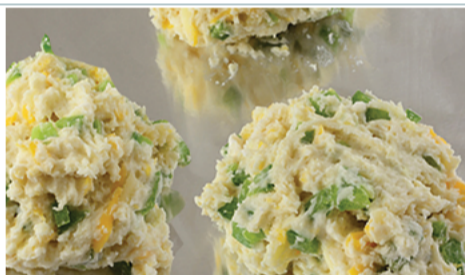
Cheddar & Jalapeno Drop Biscuits with Lime-Butter Glaze